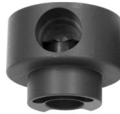
SM-MS800-4 Resin Loader for 4" #8 UN tank opening (up to 1.5" riser)