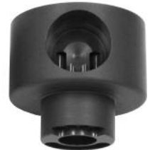
SM-MS800 Resin Loader for 2.5" NPSM tank opening (0.812" to 1.375" riser)

SM-MS800-ADPT (Not shown) Optional Adapter converts resin loader ports to 2" spigot PVC pipe size (2.375" O.D.)