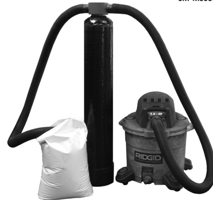
(ABOVE) TYPICAL ASSEMBLY.

NOTE: Inlet hose should never be left unattended while vacuum is in operation.