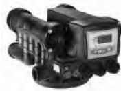
Magnum IT 764 Softener Valve