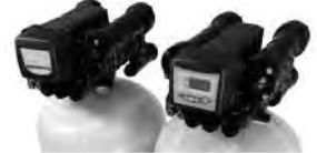
Magnum IT 764 Twin Alternating