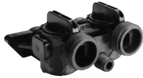
1265 Manual Bypass Valve