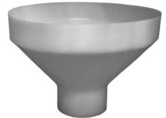
SM-F400 Resin Funnel for 4" to 6" Tank Opening (100% Polyethylene)