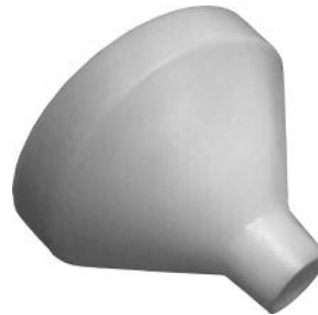
SM-F250 Resin Funnel for 2.5" Tank Opening (100% Polyethylene)