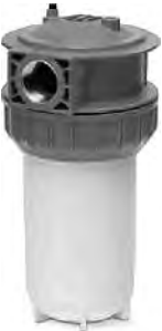
JUMBO EASY SERVICE