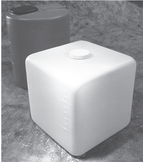
MK-CT1621 and MK-CT1515