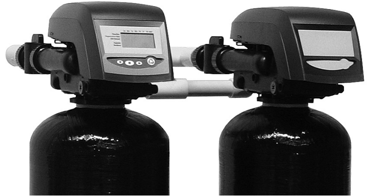
NOTE: Covers sold separately (See next page).