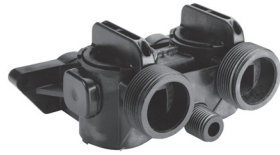
1265 Manual Bypass Valve