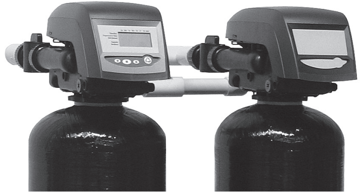
NOTE: Covers sold separately (See next page).

Service . . . . . Cv = 6.5 (Kv = 5.6) Backwash . . . . . Cv = 4.0 (Kv = 3.5) For Tank Sizes . . . . . 9 thru 21 inch diameter Distributor Port . . . . . 1.050" (3/4" pipe O.D.)