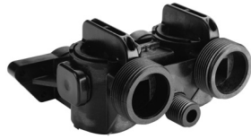
1265 Manual Bypass Valve