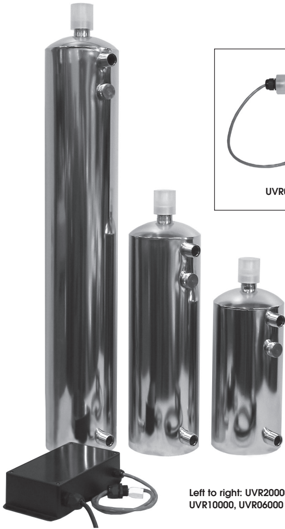
Left to right: UVR20000, UVR10000, UVR06000