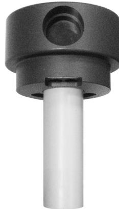
SM-MS800-6-15 SM-MS800-6-63MM SM-MS800-6-NR