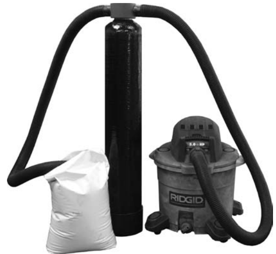
(ABOVE) TYPICAL ASSEMBLY.

NOTE: Inlet hose should never be left unattended while vacuum is in operation.