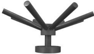
Z-style distributor shown mounted on blind flange.